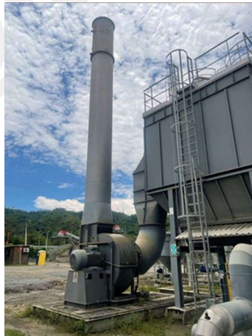
Asphalt Plant AMMANN ABC 180 SOLIDBATCH