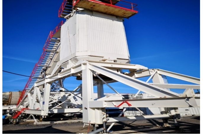
Information document – ASTEC DB7 EMI 746