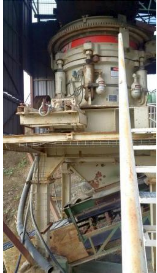
Complete METSO Crusher Plant