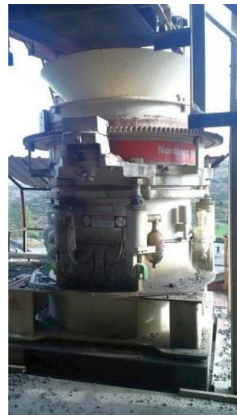
Complete METSO Crusher Plant