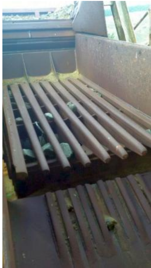
Complete METSO Crusher Plant